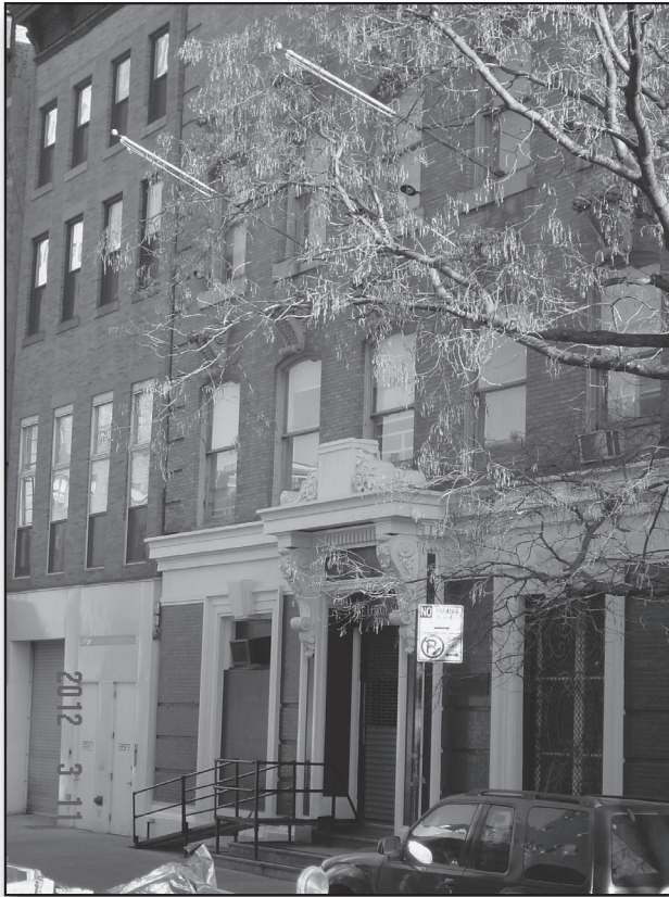
Photo: The Catholic Youth Organization (CYO) Manhattan Center on West Seventeenth Street became an important community institution in Chelsea and Greenwich Village. Begun nationally in the 1930s, local CYOs offered scheduled activities and competitive sports popular among children and youth in local parishes.

bring money in every week towards buying basketball uniforms, because they didn't provide anything like that. So in order to have a team with uniforms you paid for it yourself.... They had discussions.... They taught you how to pay for your own things in life, how to get along with each other—because we had discussions over the color of the uniforms, the name of the team. This was a big thing because you learned, when you went into business or whatever later in life, that you negotiated everything. Where if I wanted a yellow uniform I'd try and convince some of the other guys, "Why don't we get the yellow and blue, or the blue and the yellow ones." And I remember the first team, we called it the Royals. It was when they had the Rochester Royals then. I still remember the yellow uniforms with the blue, and we had an insignia of a crown and everything. So we almost designed the whole uniforms by sitting down, negotiating, buying them. He taught us how to more or less get the best buy. He had cata-