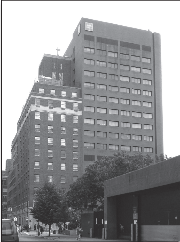
Photo: St. Vincent's Hospital on Twelfth Street and Seventh Avenue in Greenwich Village. It provided health and medical services to residents of the Village and Chelsea. It was also an important employer for residents. The hospital was founded in 1849 by the Sisters of Charity to serve the disadvantaged.