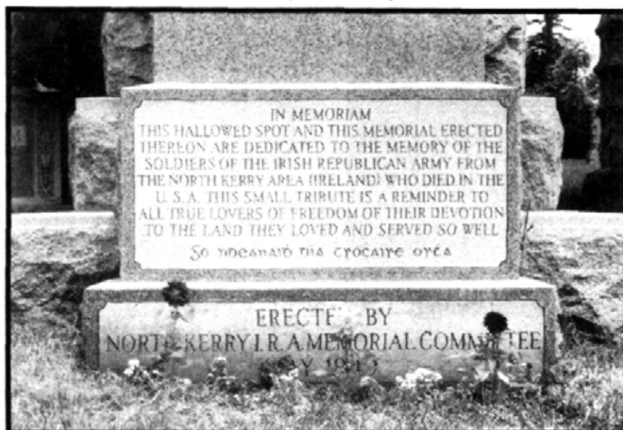
The Kerry Monument was erected in May 1949 by the North Kerry Memorial Committee in memory of IRA men who died during the Irish War of Independence (1919-21). The inscription in Irish reads "May God have mercy on them."