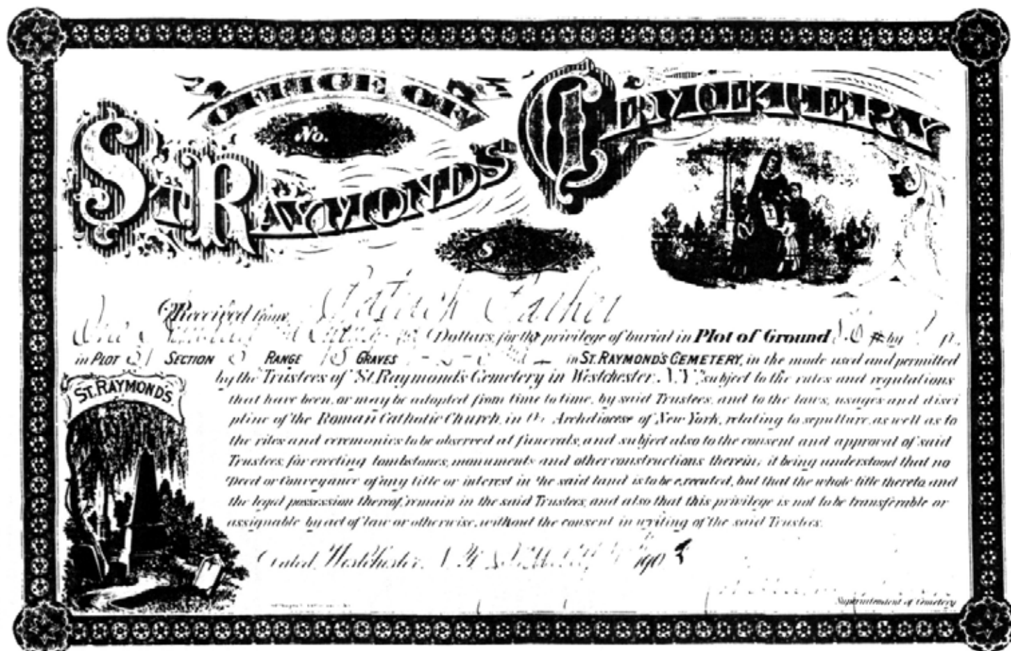
In January 1903, Patrick Parker purchased four graves in St. Raymond's Cemetery for $125. St. Raymond's opened in 1844 and is one of the largest parish cemeteries in the U.S.