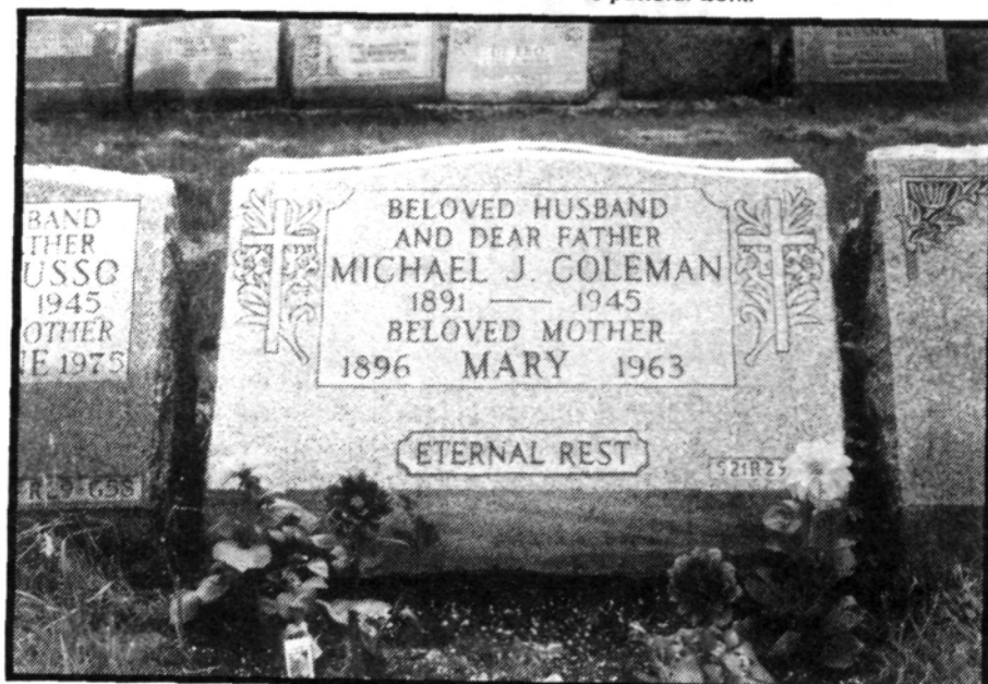
Michael Coleman was the premier Irish fiddler of his day. He emigrated to NYC in 1914 and eventually cut dozens of 78 rpm disks for a variety of American record companies. These made a stunning impression on both sides of the Atlantic, with musicians adopting the style and repertoire of Coleman's native Sligo as their own.